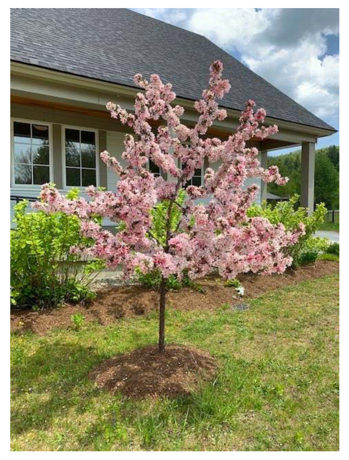
Annual Report for the year ending December 31, 2023