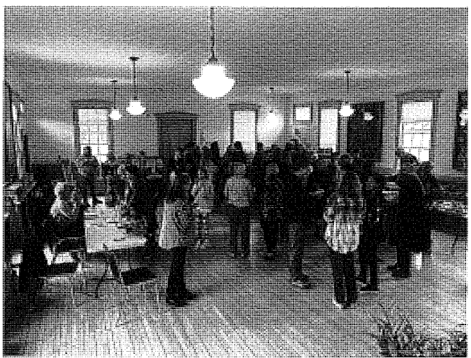
The 2023 Town Hall Social in Full Swing

Looking ahead in 2024, the Town Hall already has a number of events planned, including a Winter Doldrums Dance Party on February 10 and the second annual Friends of the Library Chili Cook Off on February 17. Weekly Martial Arts classes and more private rentals are also expected in the coming months.