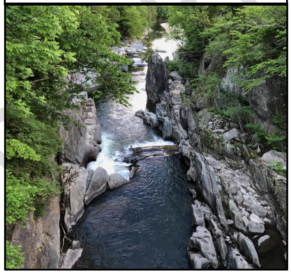
Draft-Proposed amendments 120/521/2022