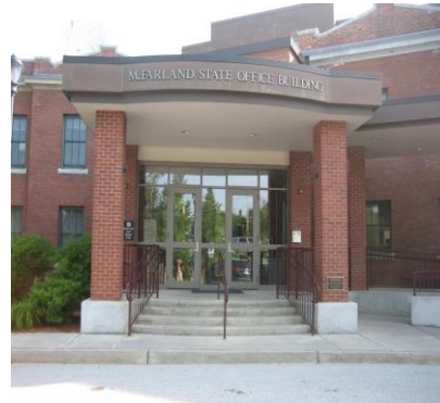
McFarland Office Building 5 Perry Street, Suite 250 Barre, VT 05641